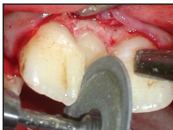
463 Double-Tooth Anomalies